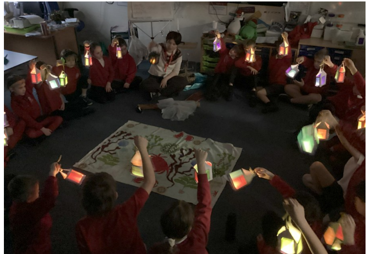
In Year 4, the children explored the story of the Mousehole Cat and made lanterns to guide Tom & Mowzer home.